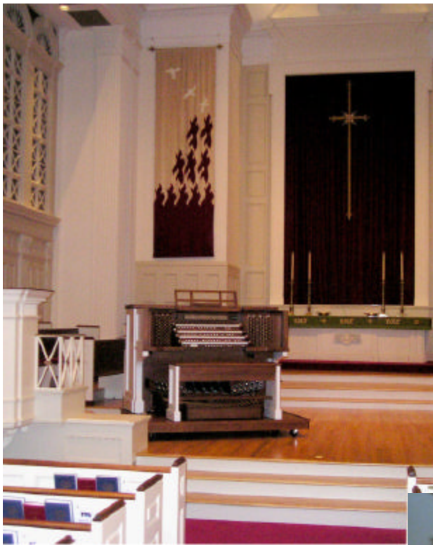
CHRIST CHURCH UCC, BETHLEHEM, PA