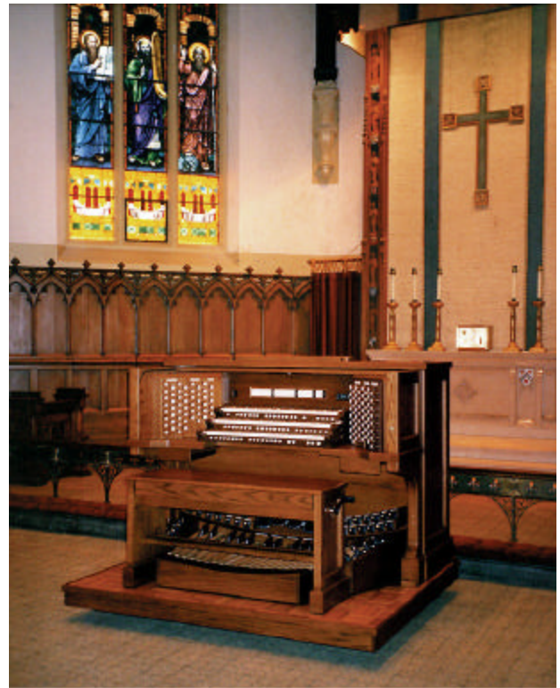
PACKER CHAPEL, BETHLEHEM, PA