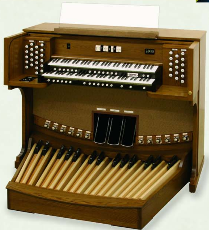
Chapel CF-15 DK 33 Stops / Two-Manuals

With Allen's Proprietary DSP Technology Stop-by-Stop and Note-by-Note Voicing Advanced MIDI Capabilities Acoustic Portrait™ – Actual Sampled Acoustics Allen's Stolist Library™ – Optional