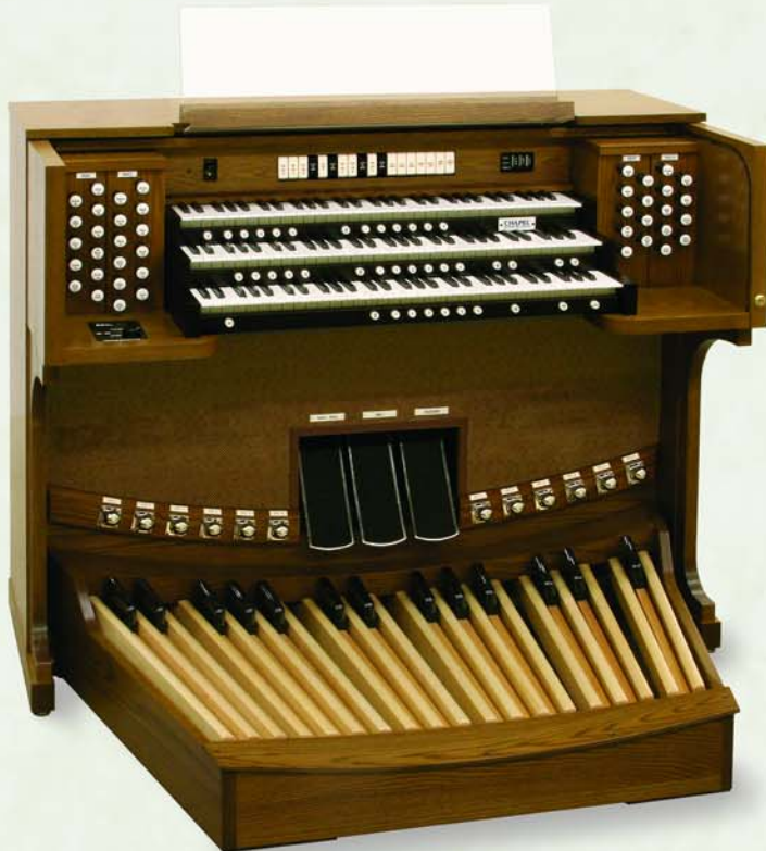
Chapel CF-30 DK 38 Stops / Three-Manuals

In 1970, a year before Allen Organ Company introduced the world's first digitally sampled musical instrument, Allen offered the first computer capture system with custom integrated circuits (LSI), bringing advanced console control capabilities to even modestly priced organs.